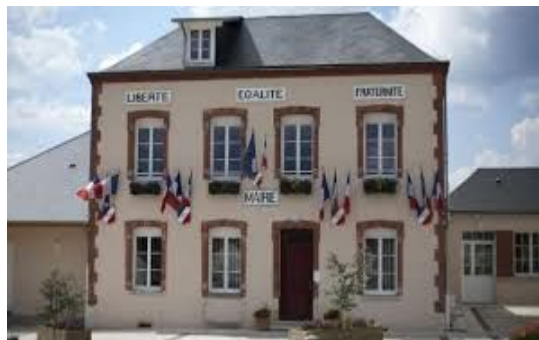
Town hall in a French town