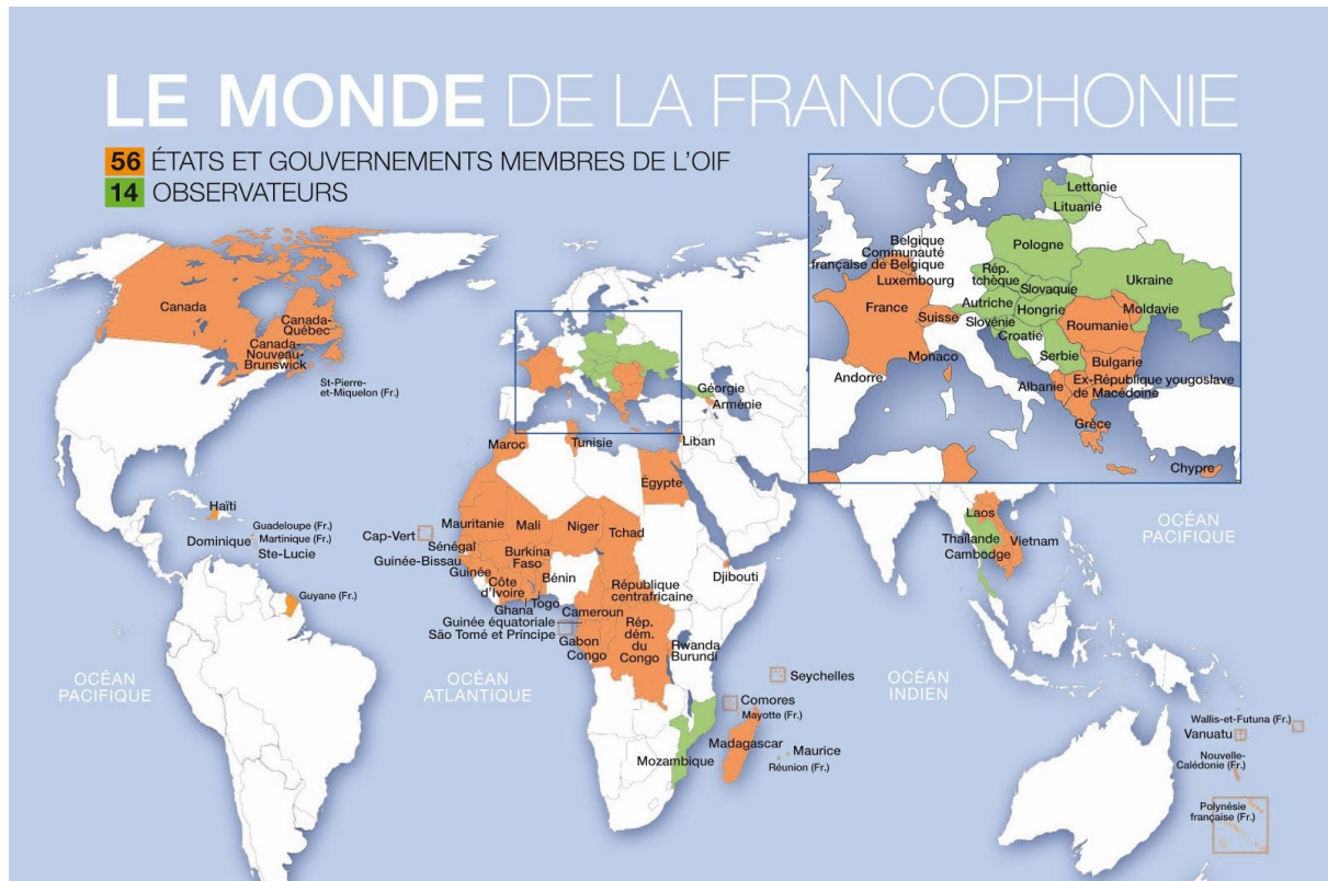
Map showing where French is spoken worldwide.

Nowadays, French is spoken by 274 millions speakers worldwide, in 29 countries ! However, not all of them are native speakers, which means that sometimes, French is their second, third or even fourth language.